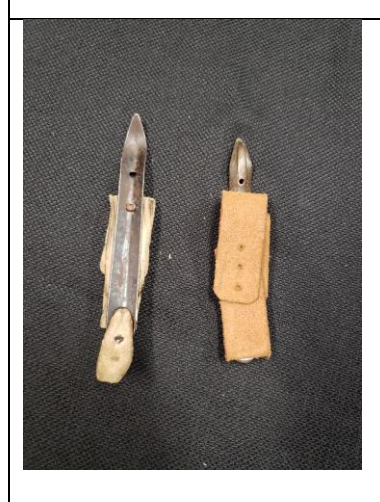
Corn Huskers (2)