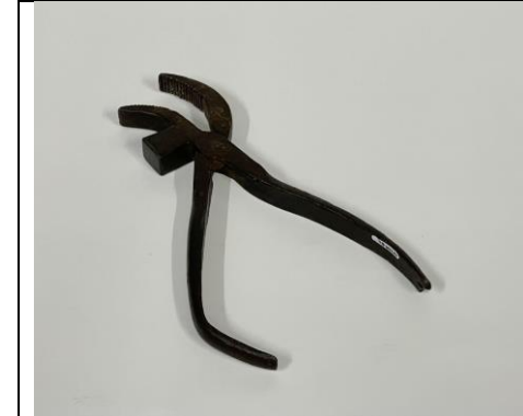
Carpenter Pinchers (pliers)