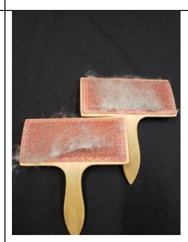
Woold Carding Combs (2)