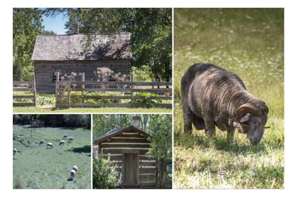
Norwegian Homestead – Old World Wisconsin

The Pioneer Life Discovery Box contains items that help students understand and explore what life was like for European and American pioneers who came to Wisconsin in the 1800s. Many of these settlers started out as farmers but most soon turned to other industries in order to make a living in this state. Before communities were established, pioneer families had to grow or make many things they would trade for or buy if they lived in a large community.