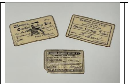
Omnibus and Trolley Tickets