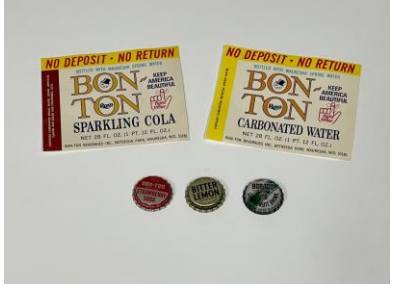
Bon-ton Cola Labels and Soda Bottle Caps